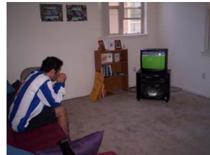
10 mins to go: The agony...

Dispatch: 4 July 2004, 11.30pm US Pacific Time; 5 July 2004, 4.30pm AEST