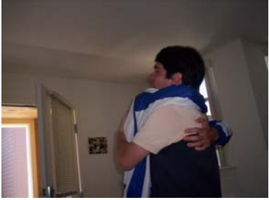
2 seconds later: The love...