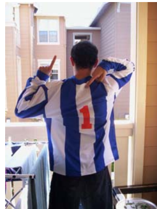
... and finally the only number you need to know.

Phone calls were made. I remember Macca screaming down the